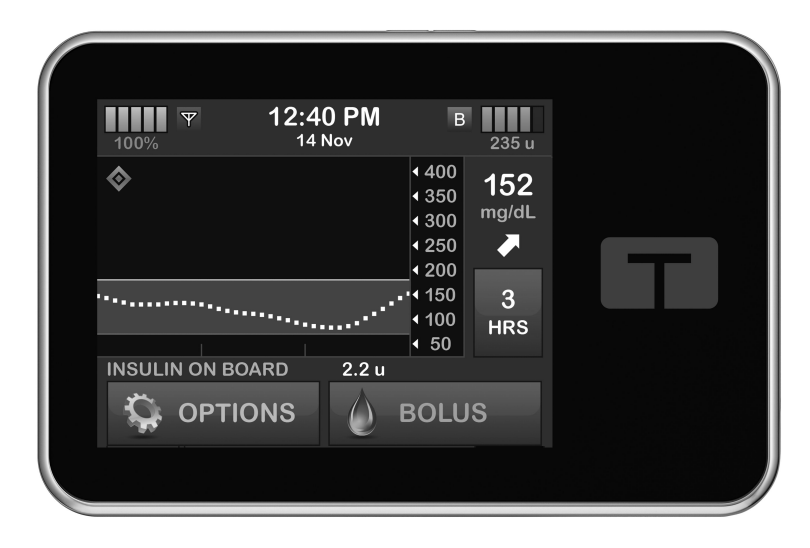
Our t:slim X2 Insulin Pump Form Factor

Today, our commercial efforts exclusively focus on the manufacturing, sale and support of our flagship pump platform, the t:slim X2 insulin delivery system, but we continue to provide ongoing service and support to existing t:slim, t:slim G4 and t:flex customers. The t:slim X2 insulin delivery system is comprised of a t:slim X2 pump, its 300-unit disposable insulin cartridge and an infusion set.