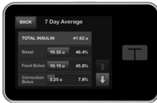
Quick Access to Pump History

Next generation technology platform. Our Micro-Delivery technology is unique compared to traditional pumps. Its miniaturized pumping mechanism draws insulin from a flexible bag within the pump’s cartridge rather than relying on a mechanical syringe and plunger mechanism. The pump is specifically designed to help prevent the unintentional delivery of insulin from the reservoir by limiting the volume of insulin that can be delivered to a person at any one time and to reduce fear associated with using a pump. Our technology was tested under both typical and extreme operating conditions and is designed to last for at least the anticipated four-year warranty life of the pump. Our technology allows us to reduce the size of the device as compared to traditional pumps, which allows our pumps to be the slimmest and smallest durable insulin pumps on the market. In addition, our technology is capable of delivering the smallest increment of insulin to users of any pump currently available, which allows insulin therapy to be individualized for each user.