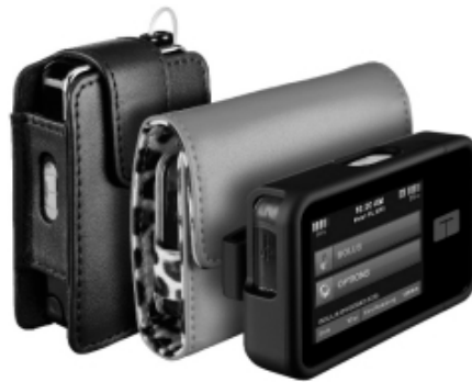
Insulin Pump Accessories

We offer our customers a broad range of accessories for their pumps, allowing users to customize their device to their individual lifestyle and sense of style. We believe our accessories increase user flexibility and willingness to use and carry their insulin pump. These accessories include different color casings, belt clips, and leather cases.