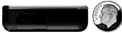
t:slim X2 Profile (Actual Size)

Compact size. With a narrow profile, similar to many smartphones, our products can easily and discreetly fit into a pocket. t:slim X2 and t:slim G4 are the slimmest and smallest durable insulin pumps on the market, while still offering a cartridge with 300 units of insulin. More specifically, t:slim X2 and t:slim G4 are at least 25% smaller than all other durable insulin pumps available in the United States, and 38% smaller than the newest insulin pump form factor offered by one of our leading competitors. t:flex offers a similar sleek pump form factor, while utilizing a cartridge with 480 units of insulin, providing enhanced flexibility to people with greater insulin needs. The size and shape of our products are designed to provide increased flexibility with respect to how and where a pump can be worn. Based on extensive consumer input during development, we believe our products address both the embarrassment and functionality concerns related to the size and inconvenience of carrying a traditional pump.