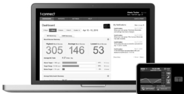
t:connect Diabetes Management Application

In 2016, we initiated the launch of an enhanced version of t:connect that we expect will simplify the ability of patients to share their t:connect data with their healthcare providers, which we refer to as t:connect HCP. We expect to make t:connect HCP available to all interested healthcare providers in 2017. This application will allow a healthcare provider to establish a separate account that centralizes t:connect data from all of their enrolled patients.