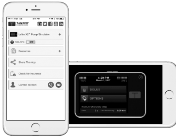
t:simulator Demonstration App

Intuitive to use. Similar to what is found in modern consumer electronic devices, the embedded software displayed on our color touchscreen features intuitive and commonly interpreted colors, language, icons and feedback. Our software also features numerous shortcuts, including a simple way to return to the Home Screen and view critical information for therapy management. These features were designed to enable users to operate their pump more efficiently and with greater confidence, and to expand the set of therapy features they regularly utilize. Users can also execute most tasks in fewer steps than traditional pumps, which we believe further encourages people to use more advanced pump features. We believe these features also allow users to more efficiently manage their diabetes without fear or frustration.