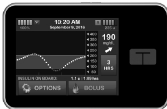
Our Insulin Pump Form Factor (Actual Size of All Tandem Pump Products)

Contemporary style. Our current products, as well as our products under development, have the look and feel of a modern consumer electronic device, such as a smartphone. Relying on significant consumer input and feedback during the development process, we believe the aesthetically-pleasing, modern design of our products addresses the embarrassing appearance-related concerns of insulin pump users. Key product features such as a high-resolution, color touchscreen with shatter-resistant glass, aluminum casing and rechargeable battery, make our products unique in the insulin pump market.