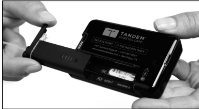
300-unit Insulin Cartridge being inserted into Pump

In the third quarter of 2016, we launched a Technology Upgrade Program that provides eligible t:slim and t:slim G4 customers a path towards ownership of t:slim X2 by providing customers the right to exchange t:slim or t:slim G4, under a variable pricing structure. The Technology Upgrade Program expires on September 30, 2017.