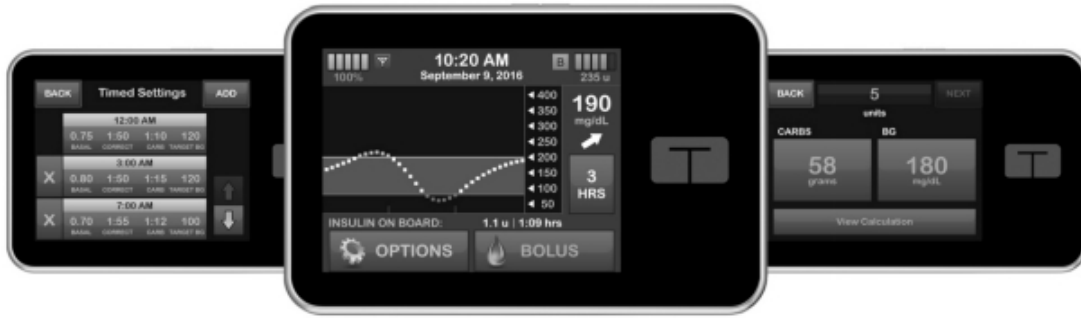
Easy-to-Navigate Pump Software Architecture

Next generation technology platform. Our Micro-Delivery technology is unique compared to traditional pumps. Its miniaturized pumping mechanism draws insulin from a flexible bag within the pump’s cartridge rather than relying on a mechanical syringe and plunger mechanism. The pump is specifically designed to help prevent the unintentional delivery of insulin from the reservoir by limiting the volume of insulin that can be delivered to a person at any one time and to reduce fear associated with using a pump. Our technology was tested under both typical and extreme operating conditions and is designed to last for at least the anticipated four-year warranty life of the pump. Our technology allows us to reduce the size of the device as compared to traditional pumps, which allows our pumps to be the slimmest and smallest durable insulin pumps on the market. In addition, our technology is capable of delivering the smallest increment of insulin to users of any pump currently available, which allows insulin therapy to be individualized for each user.