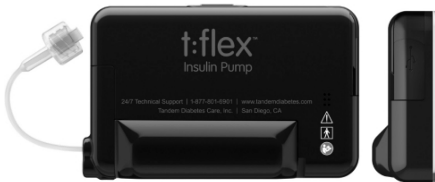
t:flex Insulin Pump

t:flex Insulin Delivery System is comprised of a t:flex Pump, its 480-unit disposable insulin cartridge and an infusion set. We began commercial sales of t:flex in the United States in the second quarter of 2015.