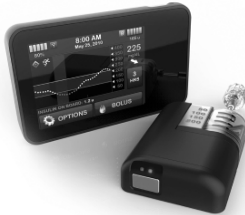
t:sport shown with touchscreen controller

that differs from our current Micro-Delivery technology and will be controlled through a separate controller or mobile device application.