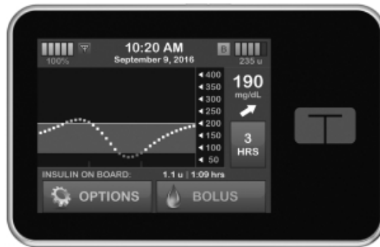
Our t:slim X2 Insulin Pump Form Factor (Actual Size)

Contemporary style. t:slim X2, as well as our products under development, has the look and feel of a modern consumer electronic device, such as a smartphone. Relying on extensive consumer input and feedback received during the development process, we believe the modern and innovative design of our products addresses the embarrassing appearance-related concerns of insulin pump users. Key product features such as a high-resolution, color touchscreen with shatter-resistant glass, aluminum casing and rechargeable battery, make t:slim X2 unique in the insulin pump market.