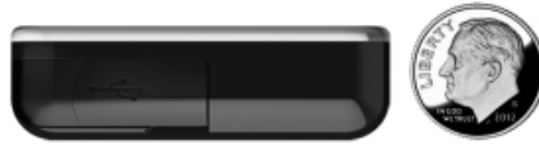
t:slim X2 Profile (Actual Size)

extensive consumer input during development, we believe our products address both the embarrassment and functionality concerns related to the size and inconvenience of carrying a traditional pump.