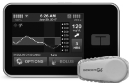
t:slim X2 with Control IQ

We previously referred to this system under its development name, the t:slim X2 with TypeZero and, following FDA approval, intend to market the product under the name t:slim X2 with Control IQ. This hybrid closed loop product will be differentiated from competing products, as we expect it will provide automated correction boluses, which we believe will bring additional benefits to our customers. In our market research, people with insulin-dependent diabetes and their healthcare providers reported a strong preference for t:slim X2 with Control IQ as compared to a competitive AID system.