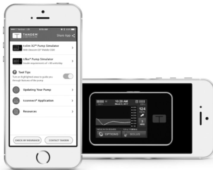
t:simulator App Accessible Through Mobile Device

Easy to learn and teach. Our technology platform allows for the use of a color touchscreen and easy-to-navigate software architecture, providing users intuitive access to the key functions of their pumps directly from the Home Screen. Insulin pump users can quickly learn how to efficiently navigate their pumps' software, thereby enabling healthcare providers to spend less time teaching a person how to use the pump and more time improving management of their diabetes. We believe these features also allow healthcare providers to more efficiently train people to use our pump and have a higher degree of confidence that users can successfully operate our pump, including its more advanced features. Our touchscreen technology also allows us to offer our t:simulator App, which permits anyone to experience our easy-to-navigate software for any of our pumps free of charge on a mobile device. We believe the ease with which our pump can be learned and taught, and the accessibility of our t:simulator App that broadly demonstrates our software technology, will help attract consumers who may have been frustrated or intimidated by traditional pumps.