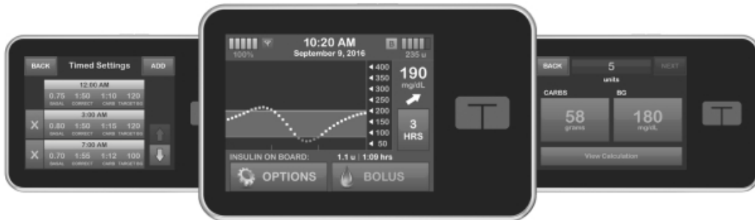
Easy-to-Navigate Pump Software Architecture

Intuitive to use. Similar to what is found in modern consumer electronic devices, the embedded software displayed on our color touchscreen features intuitive and commonly interpreted colors, language, icons and feedback. Our software also features numerous shortcuts, including a simple way to return to the Home Screen and view critical information for therapy management. These features were designed to enable users to operate their pump more efficiently and with greater confidence, and to expand the set of therapy features they regularly utilize. Users can also execute most tasks in fewer steps than traditional pumps, which we believe further encourages people to use more advanced pump features. We believe these features also allow users to more efficiently manage their diabetes without fear or frustration.