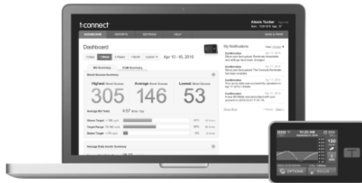
t:connect Diabetes Management Application

In 2017, we launched an enhanced version of t:connect that we expect will simplify the ability of pump users to share t:connect data with their healthcare providers, which we refer to as t:connect HCP. This application allows a healthcare provider to establish a separate account that centralizes t:connect data from all of their enrolled patients.