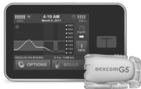
t:slim X2 with Basal IQ

The t:slim X2 with Basal IQ is designed to utilize Dexcom G5 sensor values to adjust the rate of insulin delivery to help minimize the frequency and/or duration of hypoglycemic events. The algorithm was developed internally in consultation with clinical thought leaders in AID research. In our market research, a predictive low glucose suspend, or PLGS, algorithm was reported as the most valuable AID feature among people with insulin-dependent diabetes and their healthcare providers.