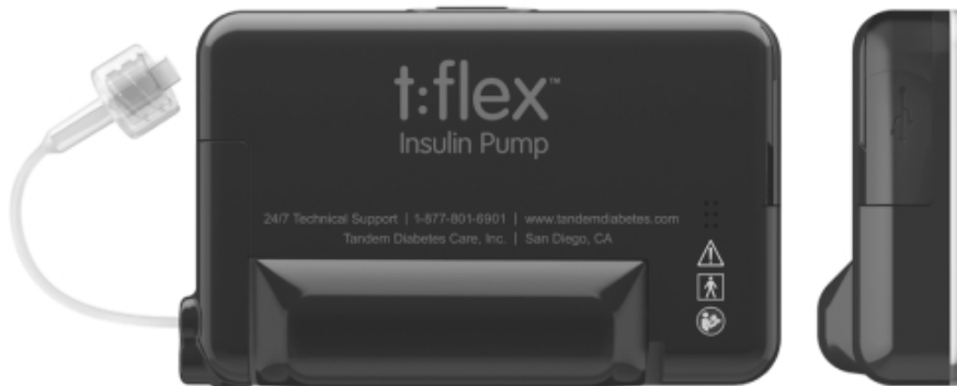
t:flex Insulin Pump

The t:flex Insulin Delivery System is comprised of a t:flex pump, its 480-unit disposable insulin cartridge and an infusion set. We began commercial sales of t:flex in the United States in the second quarter of 2015.