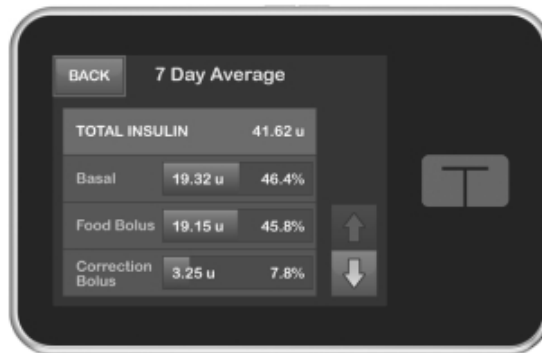
Quick Access to Pump History

Innovative technology. Our Micro-Delivery technology is unique compared to traditional pumps. Its miniaturized pumping mechanism draws insulin from a flexible bag within the pump's cartridge rather than relying on a mechanical syringe and lead screw mechanism. Our technology was tested under both typical and extreme operating conditions and is designed to last for at least the anticipated four-year warranty of the pump. Our technology allows us to reduce the size of the device as compared to traditional pumps, making t:slim X2 the slimmest and smallest durable insulin pump on the market. In addition, our technology is capable of delivering the smallest increment of insulin compared to any pump currently available, which allows insulin therapy to be individualized for each user.