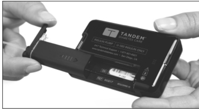
300-unit Insulin Cartridge being inserted into t:slim X2 Pump

United States in the fourth quarter of 2016. Measuring 2.0 x 3.1 x 0.6 inches, t:slim X2 is the slimmest and smallest durable insulin pump on the market. t:slim X2 features new hardware advancements, including a two-way Bluetooth wireless technology radio for communicating with more than one external device at a time.