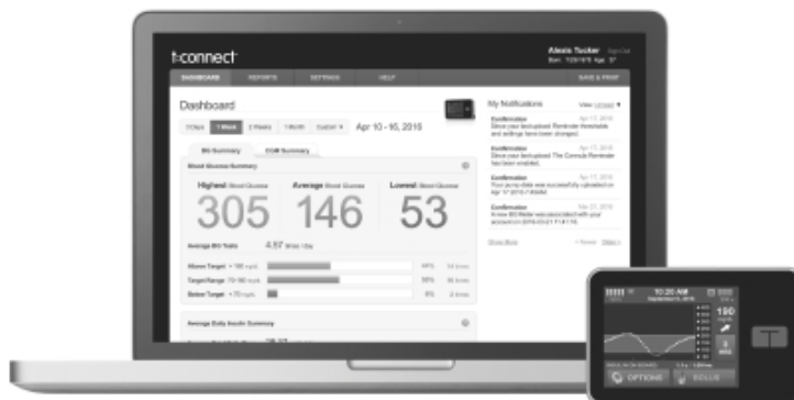
t:connect Diabetes Management Application

In 2017, we launched an enhanced version of t:connect that we expect will simplify the ability of pump users to share t:connect data with their healthcare providers, which we refer to as t:connect HCP. This application allows a healthcare provider to establish a separate account that centralizes t:connect data from all of their enrolled patients.